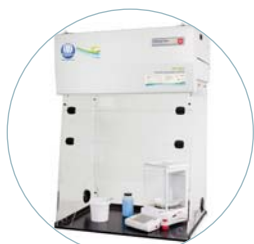
XIT Plus Larger cabinets, with more features