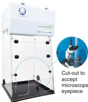
Cut-out to accept microscope eyepiece

Please tell us of your specific needs and our design team will offer a custom enclosure solution or bespoke finishing of a standard cabinet.