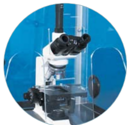
Specialist application and custom built Examples include: Asbestos Inspection Cabinets