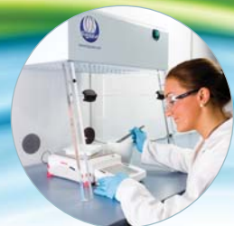
F3-XIT Small footprint weighing cabinets

For protecting the operator from hazardous airborne particulates and powders