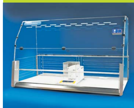
For installation into existing ducting