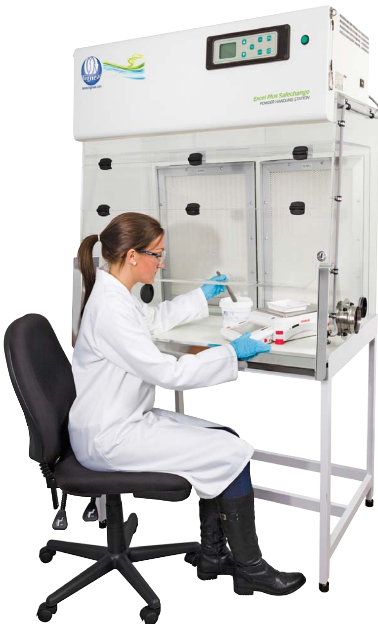
EXCEL Plus Safechange

Email: info@bigneat.com Tel: +44 (0)23 92 266400