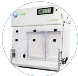
EXCEL Plus Safechange Cabinets for the most hazardous powders