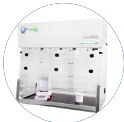
EXCEL Plus For more demanding weighing applications, turbulent free air flow