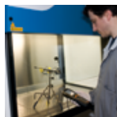
AIR FLOW SPEED TEST

Each Faster cabinet is tested conforming to EN - 12469:2000, EN - 61010:2001 and released with FAT certificate of the tests performed.