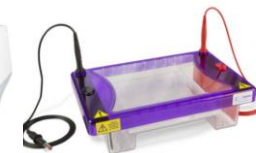
Horizontal gel unit

For additional product details, please visit www.appletonwoods.co.uk or contact your local Appleton Woods sales rep