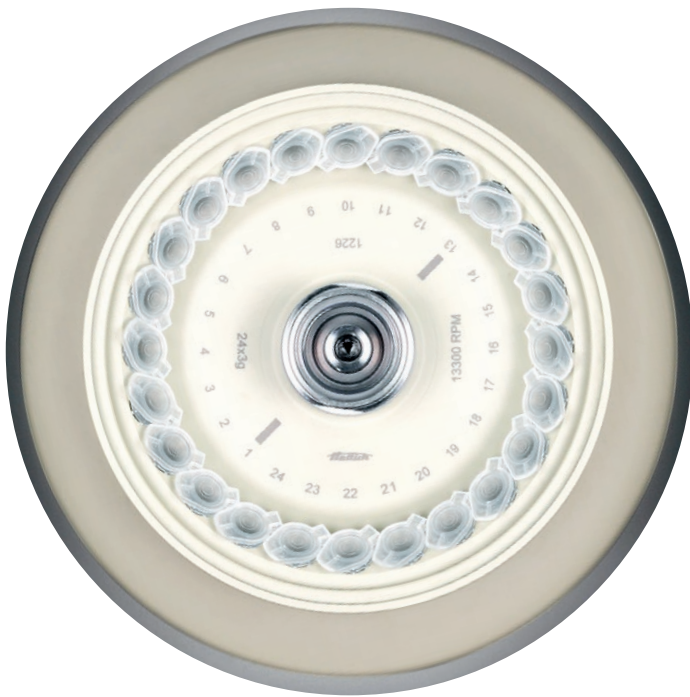
View into the centrifuging chamber showing the rotor 1226