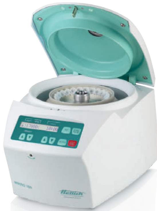
MIKRO 185 Microlitre centrifuge

Its compact dimensions mean that the MIKRO 185 takes up little space on the workbench.