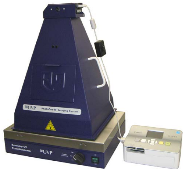
PhotoDoc-It with Color Printer