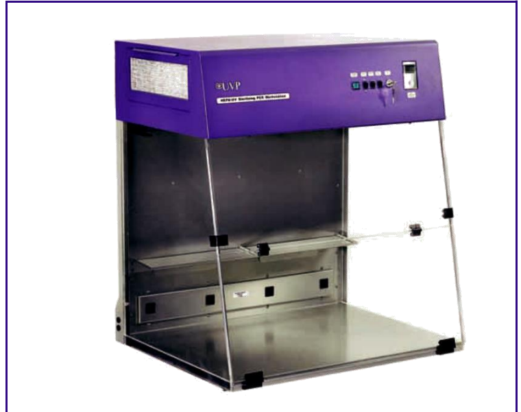
UV3 HEPA PCR Systems (workstation shown) feature four stage filters, antimicrobial coated stainless steel and shortwave UV.

Duct includes a shortwave (254nm) ultraviolet tube for eliminating airborne microbes