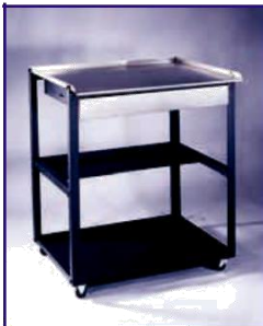
Optional PCR table features two rigid and two adjustable, locking casters. Antimicrobial coated stainless steel reduces bacterial growth. The table accommodates all UVP PCR cabinets and workstations.