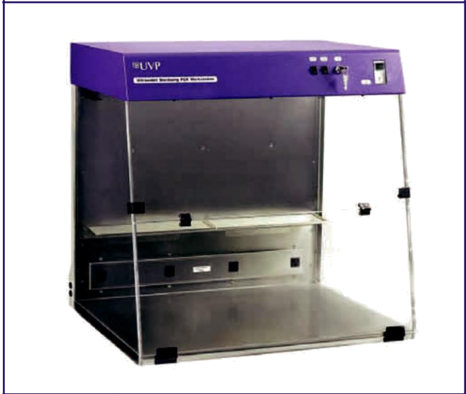
UV PCR Workstation shown. Smaller footprint, UV PCR Cabinet also available.

UV Sterilization. All UVP PCR systems create an ideal environment for PCR preparation by reducing the chance of sample contamination. Control potential PCR contamination with 254nm UV tubes built into the chamber. UV2 models feature both overhead UV and built-in UV air recirculator for continuous sterilization.