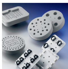
Accessory Heads for Vortex Mixer