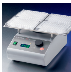
Digital Microplate Shaker

The Corning LSE Digital Microplate Shaker features digital control of shaking speed and run time. A single control knob is used to set parameters, and values are shown on a large 3-digit display. A sturdy base encloses the motor for quiet, vibration-free operation.