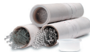
Melting point tubes