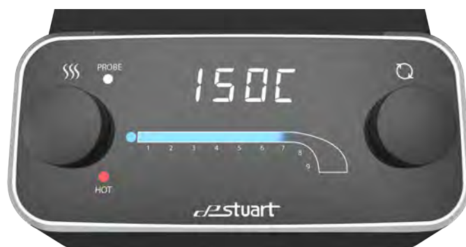
Hotplate Stirrer digital interface

With constant digital temperature display