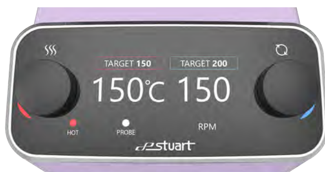
Hotplate Stirrer premium interface

With TFT display for temperature and stirring