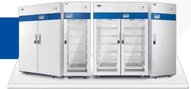
HYC-1099F HYC-509 HYC-1099 HYC-509F