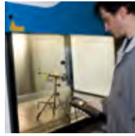
AIR FLOW SPEED TEST