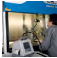
FILTER LEAKAGE TEST