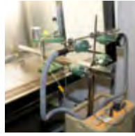
KI DISCUSS TEST

Each Faster cabinet is tested conforming to EN 12469:2000, EN 61010:2001 and released with FAT certificate of the tests performed.